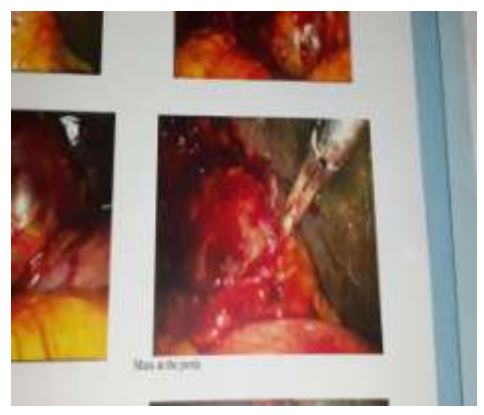
Fig 1:Intraoperative findings: solid cystic mass lesion at the porta

Post operative course of the patient was uneventful. Patient was discharged on day 7 in a healthy condition. Histopathological confirmed it to be a primary biliary schwannoma with free margins and node negative with immunohistochemistry being positive for S100. It was negative for CD 117 kit and CD 34.At a follow up after 6 month the patient is asymptomatic without any signs of recurrence.